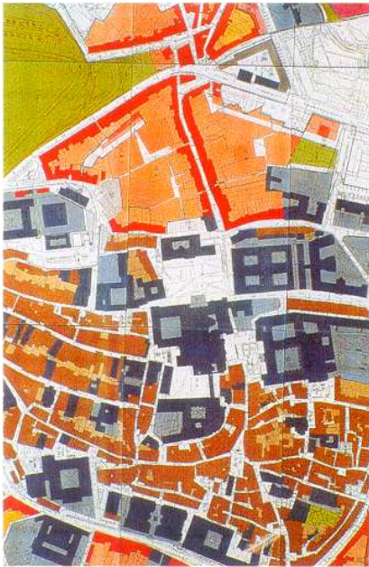
1998 First Prize for Local Planning: Special Plan for the historical town centre of Santiago de Compostela, Spain.

ECTP-CEU organised three series of the European Urban and Regional Planning Awards with the financial support of the European Commission (DG XVI) in 1990, 1994 and 1998.