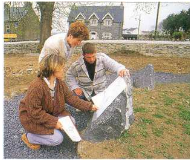
1998 Special Merit Award: Implementing quick local Community plan in Kilkenny, Ireland.

ECTP-CEU organised three series of the European Urban and Regional Planning Awards with the financial support of the European Commission (DG XVI) in 1990, 1994 and 1998.