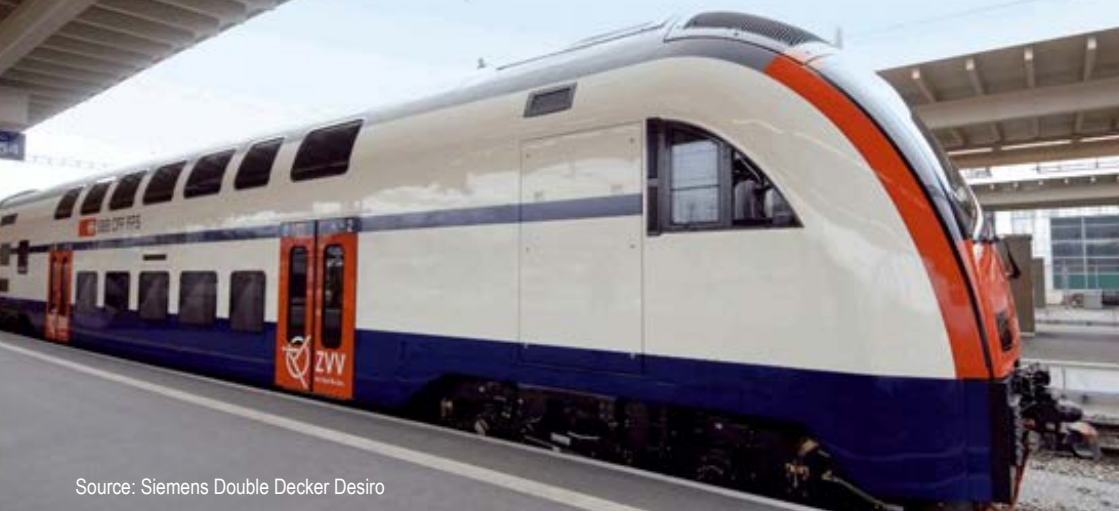
Source: Siemens Double Decker Desiro