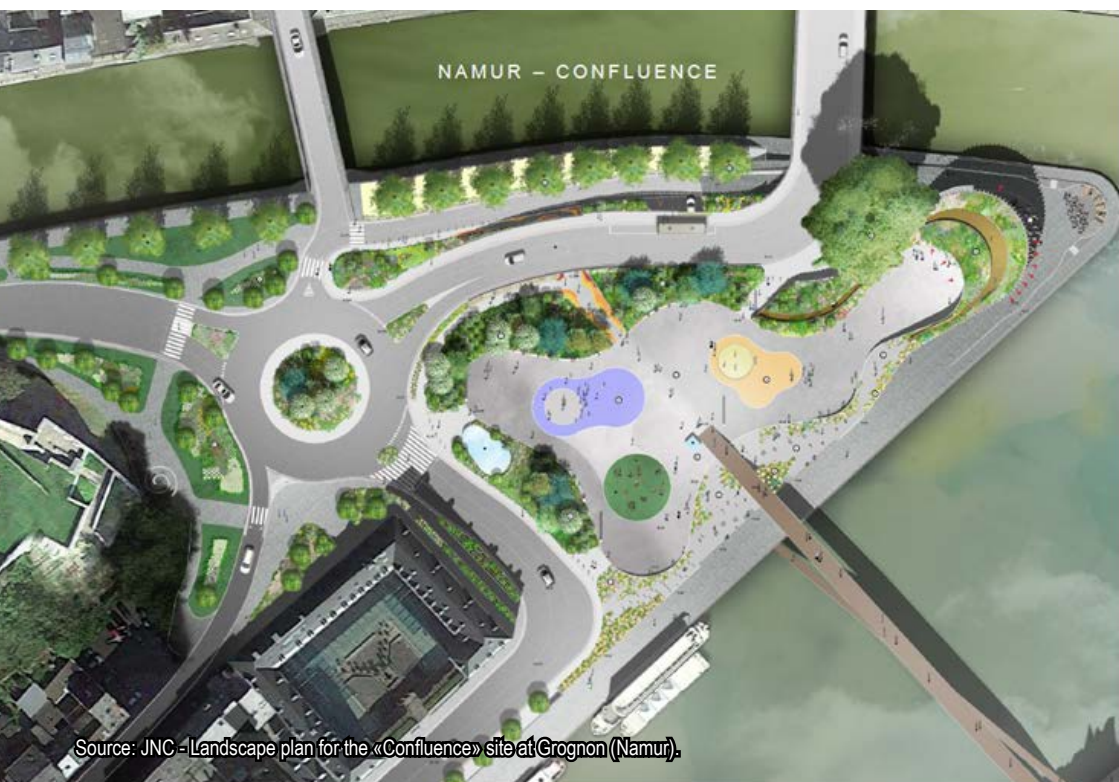
Source: JNC -Landscape plan for the «Confluence» site at Grognon (Namur).